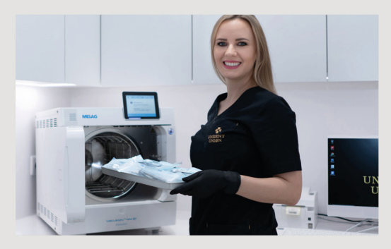
"Quality, efficiency and the great reliability of the Evolution series ensure optimal workflows: This allows us to focus even better on treating our patients."

Unident Union Dental Spa, Wroclaw, Poland