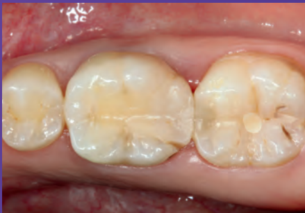
Initial situation: Fractured old composite restoration of first lower molar.

A patient needed a replacement of a fractured composite on the first lower molar. Impression was made with 3M™ Impregum™ Penta™ Super Quick Medium Body Polyether Impression Material in the monophase technique.