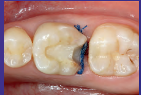
Challenging moisture control and bleeding managed by using soaked retraction cord.