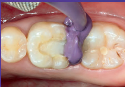
Impression was taken with the monophase technique. Syringing of 3M™ Impregum™ Penta™ Super Quick Polyether Impression Material (Medium Body) around preparation with the 3M™ Penta™ Elastomer Syringe.