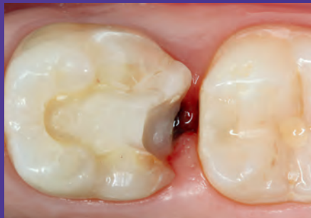
Deep distal preparation with bleeding from inflamed gingival tissue.