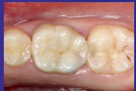
Final situation: 3M™ Lava™ Esthetic Fluorescent Full-Contour Zirconia restoration cemented with 3M™ RelyX™ Unicem™ 2 Self-Adhesive Resin Cement.